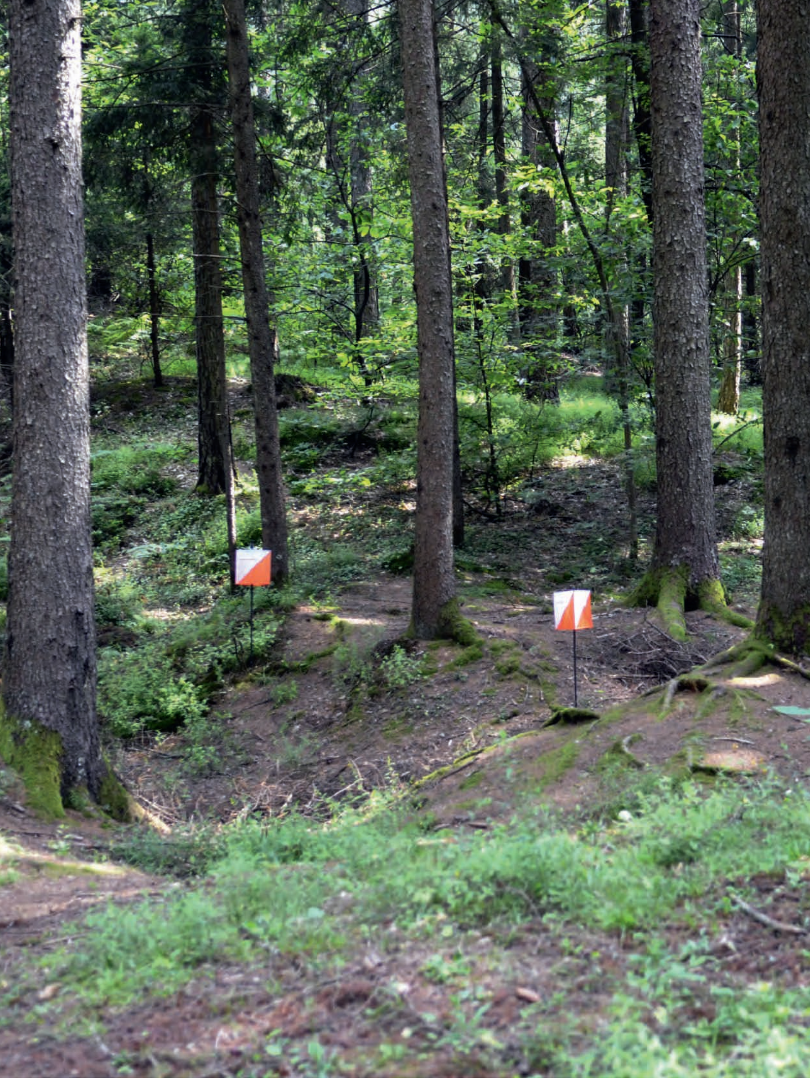
Control flags for Trail Orienteering.