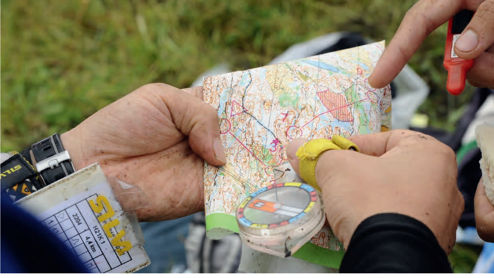
Orienteering map with a course and a free zone for wildlife.