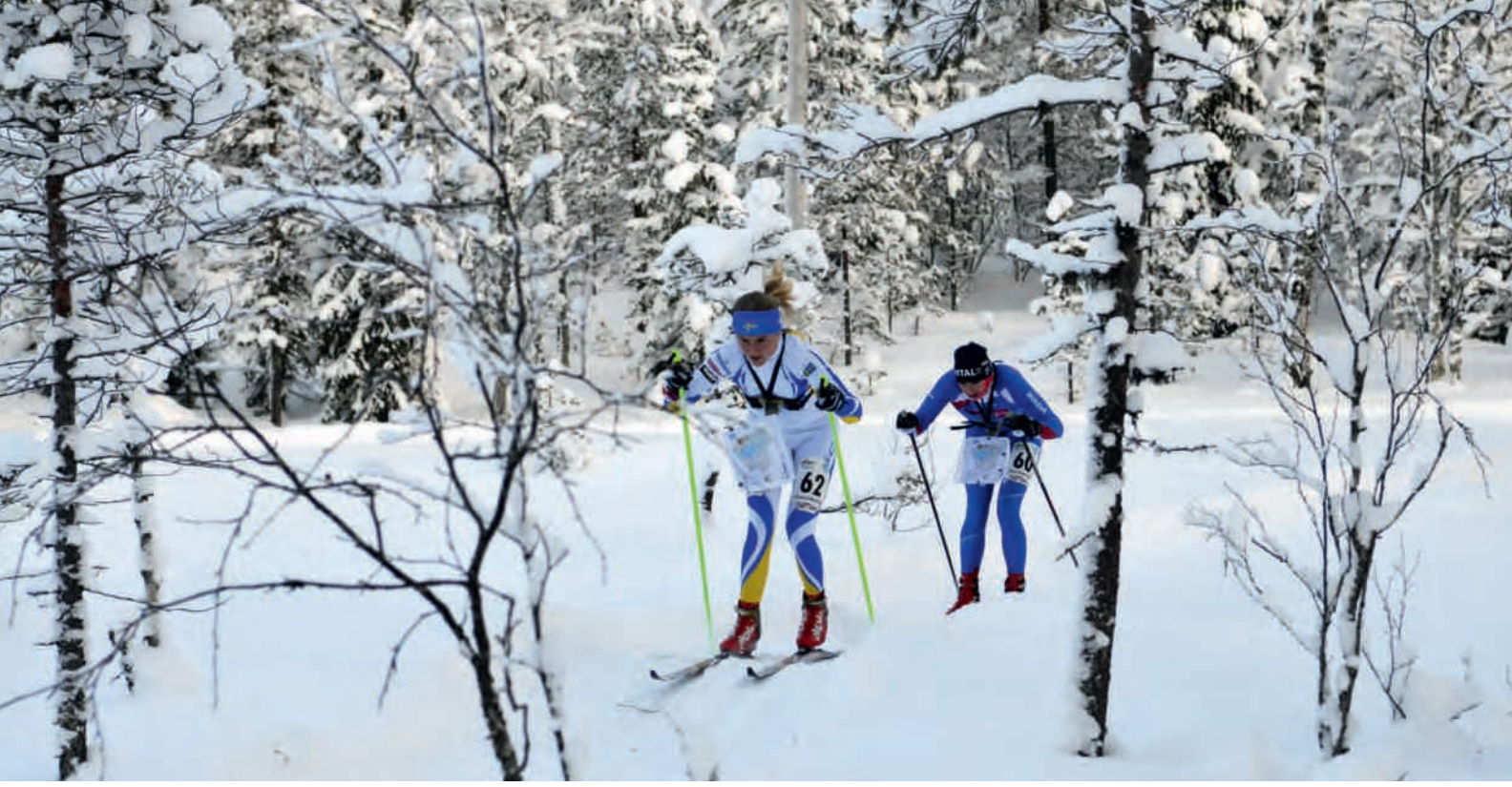
Ski orienteering where the orienteer decides the best route choice among the tracks marked on the map.